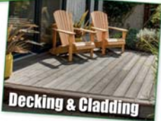
Decking & Cladding